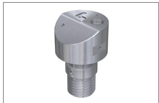
Parts up to 80x80x80mm or Ø65mm L100 can be efficiently machined