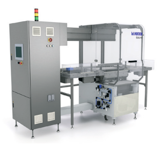
Mikron EcoLine™ Assembly Automation