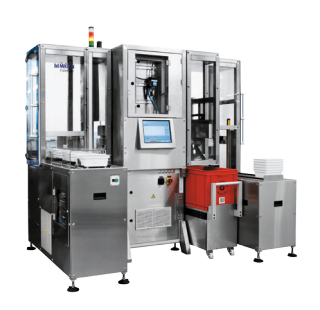
Mikron Tray Handler