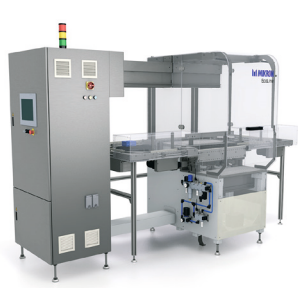
Mikron EcoLine<sup>™</sup> Assembly Automation