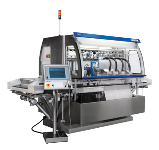
Mikron G05<sup>™</sup> Assembly Automation