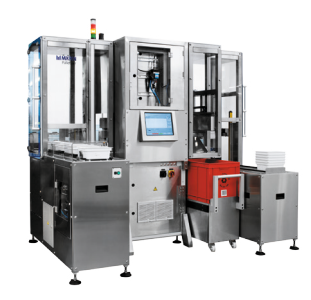
Mikron Tray Handler